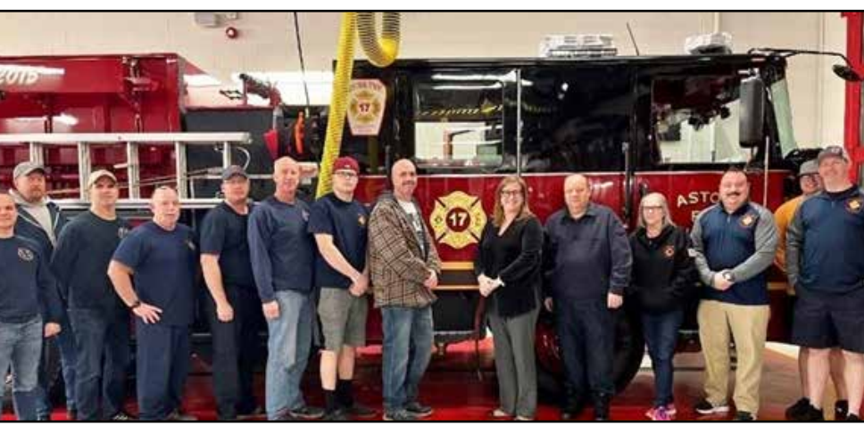
I visited the volunteers who serve our community at the Aston Twp. Fire Dept. It was great to get a look at their new truck!