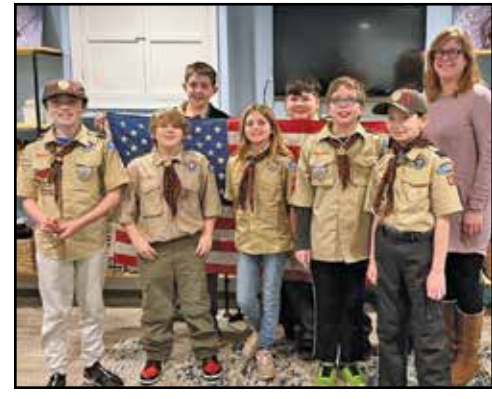
I met with Middletown Scout Pack 85. They were working on their "Building a Better World" badge and needed to interview an elected official.