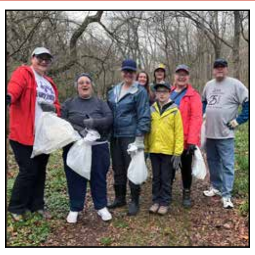
My staff and I joined local volunteers at Taylor Arboretum at Widener University for the CRC Watersheds Stream Cleanup.